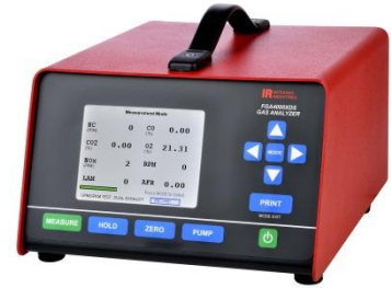
FGA4500XDS Gas Analyzer

The FGA4500 Gas Analyzer is the sister of the FGA4000XDS and provides an LCD screen with multi-language capability. Currently it comes with English, Spanish, and Arabic; it can be customized to include other languages. The FGA4500 is a portable and dynamic gas analyzer that can speed up emissions testing, tune-ups, and real-time diagnostics testing. Accurate and quick—it offers immediate results in only two seconds and is the fastest analyzer on the market—it is the must-have solution for every performance tuning center and automotive or motorcycle service facility.