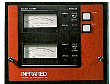
IR-702 Dual-Gas Analyzer

IRI developed the IR-7100 Infrared Bench , IR-7200 Infrared Bench , and IR-7500 Infrared Bench , which were available in single-gas, dual-gas, and sealed gas configurations.