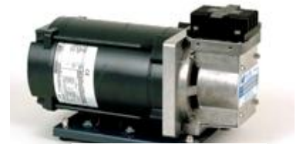
IR-1050 Centurion Explosion-Proof Pump

The single-head handles a pressure range of 6.1-71 PSIG, the dual-head handles a pressure range of 55-75 PSIG, and the quad-head handles a pressure range of 70-75 PSIG, all depending on how they are configured. The single-head has a vacuum range of 8.4-25.2 In Hg, the dual-head has a vacuum range of 24-28.4 In Hg, and the quad-head has a vacuum range of 24.8-29.3 In Hg, depending on configuration. The single-head has a maximum flow range of 9.4-30.2 LPM, the dual-head has a maximum flow range of 51.1-73, and the quad-head has a maximum flow range of 100-142.2, depending on configuration.