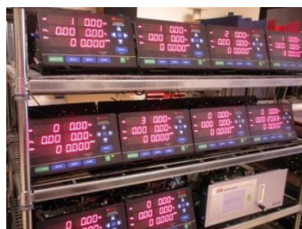
InfraView Software Manages Several Analyzers

InfraView from Infrared Industries is an easy-to-use yet powerful software program for control and display of its industry-leading portfolio of gas analyzers. Up to 16 analyzers can be managed and viewed from one PC console, which makes efficient operation possible.