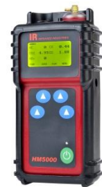
HM5000 Gas Analyzer

Infrared Industries started development on the HM5000 in 1998 and it was produced in 2002. This analyzer not only tests for emissions, but also includes onboard diagnostics. The HM5000 can be connected to a vehicle's exhaust while it is being driven and in less than a second the composition of the exhaust gas can be seen, including exactly how much Hydrocarbons (HC), Carbon Monoxide (CO), Carbon Dioxide (CO 2 ), Oxygen (O 2 ), and Oxides of Nitrogen (NO x ) the vehicle is emitting.