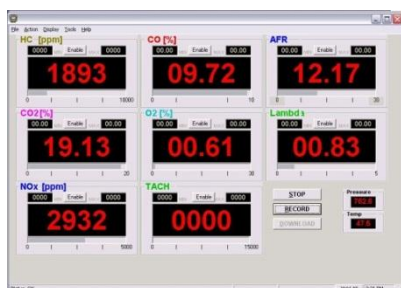
IRI Display Software Console

IRI Display Software from Infrared Industries is a Windows-based software program that allows remote control and display of the Infrared Industries FGA4000XDS, FGA4500, and HM5000 Gas Analyzers. IRI Display allows the user to view, store, plot, and print data in addition to controlling the analyzer.