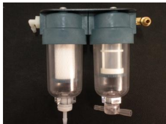
Infrared Industries Filters

Infrared Industries makes filters that remove particle sizes down to one micron and coalescing filters for removing water vapor and other contaminants in the sample stream.