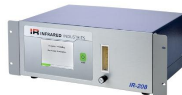
IR-208 Gas Analyzer

The IR-208 Gas Analyzer is the latest evolution of Infrared Industries' industrial/analytic analyzer. Introduced in 2008, it eclipses all of its predecessors. Infrared Industries designed the IR-208 to be a platform analyzer, allowing it to be specifically tailored to a customer's needs. The customer stipulates which gases they want to measure and over what ranges. The IR-208 features enhanced capabilities, enabling it to utilize infrared and additional sensor technologies. This enables the IR-208 to offer the customer a choice of over 250 gases.