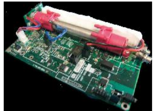
IR-510 NDIR Optical Bench